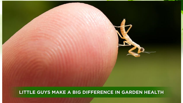
LITTLE GUYS MAKE A BIG DIFFERENCE IN GARDEN HEALTH

LIFE CYCLE: Praying Mantids ( Tenodera sinensis ) hatch out of their egg case (ootheca) along the seam that looks like louvered windows with some mud packed on top. They hatch in the spring when the weather warms, the warmer the temperature, the sooner they hatch. Unlike most insects the mantids do not hatch as larvae, they emerge as miniature adults, about half an inch long. They will grow through spring and summer until they reach a length of 5 to 6