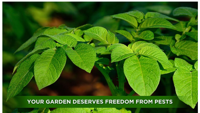
YOUR GARDEN DESERVES FREEDOM FROM PESTS

inches, shedding their skins several times. Although mantids have wings, they do not use them until fall when the female wings develop and she begins flying around looking for males to mate with. After mating, she eats the head off the male, which helps to nourish her eggs. She then attaches the brown foam to a branch, lays her eggs inside, and dies shortly afterward. The eggs are protected from the winter cold in the foam and the cycle begins again in the spring.